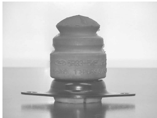
(OE rear bumpstop and plate)