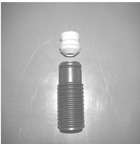
(Eibach front bumpstop / Eibach boot)