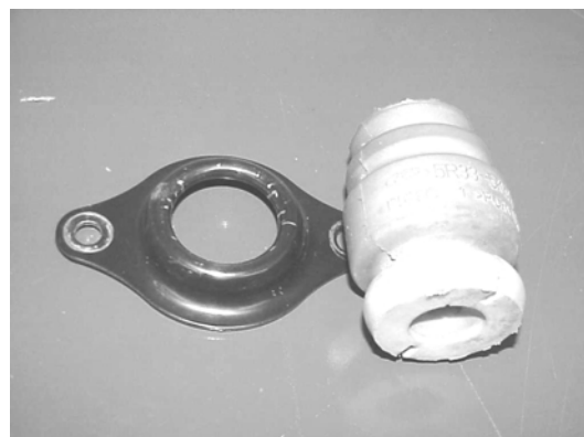
(OE bumpstop separated from mounting plate)