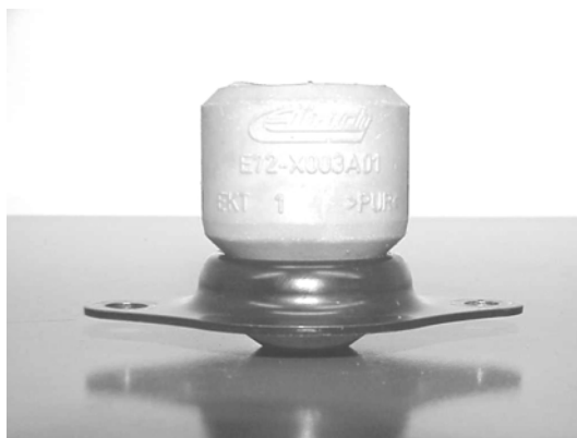
(Eibach bumpstop / OE plate)